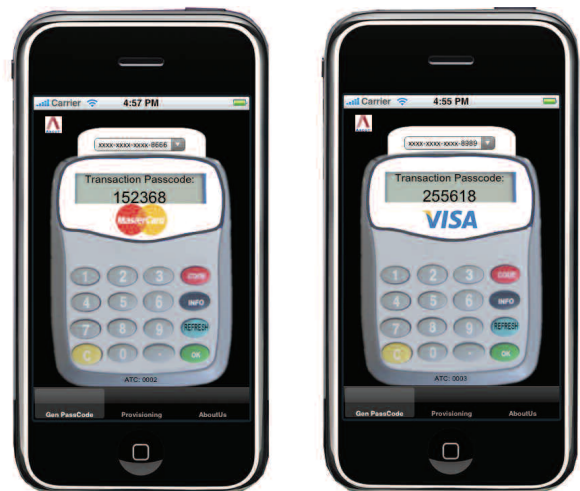
The user can use their mobile phone to automatically generate the one-time passcode to be entered to gain access to their account or to complete the payment transaction

When the user makes a web purchase or logs into an online account, the experience is identical to the conventional CAP/DPA solutions. The user gets out the mobile device, runs the ArcotOTP application, enters the PIN, and generates the dynamic passcode. Just as with the traditional disconnected reader, no wireless or other connectivity is needed. ArcotOTP can store and authenticate multiple cards at once. Users can easily select the card that they want to use. ArcotOTP will generate the